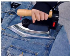
Step 1 Iron the garment

Iron-on backing attaches the patch to the fabric by applying heat and ironing with pressure. Usually used on denim and cotton, do not use iron-on backing patches on towels, leather, polyester, nylon, and corduroy. Also, do not use this type of backing on fabrics with a rough surface. If it is used for hats, it will be better to use a hat press rather than an iron. Or the patch will be heated unevenly and cannot be firmly attached.