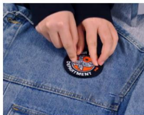
Step 2 Put on the patch