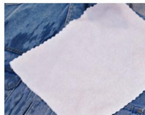
Step 3 Place damp cloth over patch